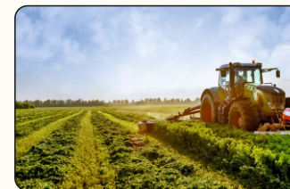
Agriculture/ Agro Processing