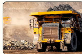
Mining & Minerals