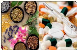
Pharmaceutical & Ayurveda