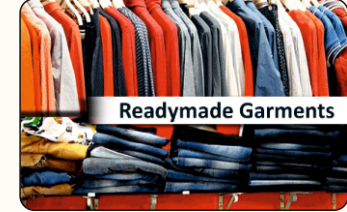
Textiles & Ready-Made Garments