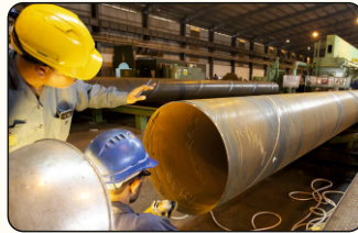
Steel & Allied Products