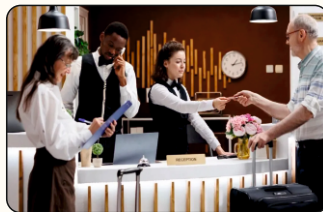
Hotels & Hospitality