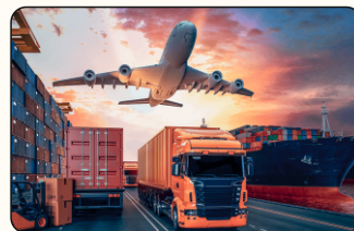
Logistics and Transportation